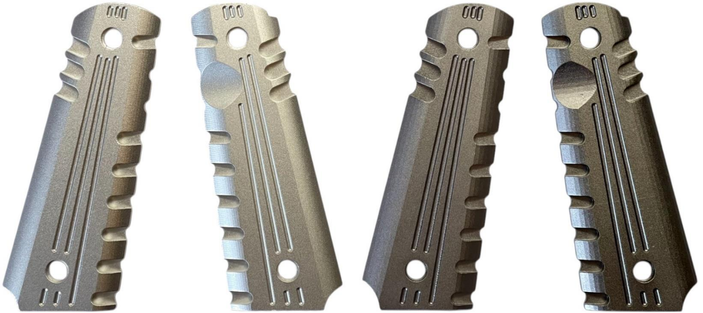
Polymer Tactical Grips / Covers with Rail