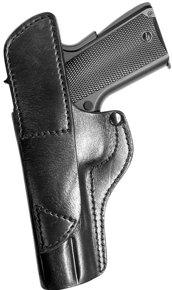
IWB LEATHER HOLSTER