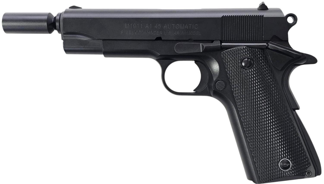
M1911 5.0" BARREL GOVERNMENT 9mm PAK Blank