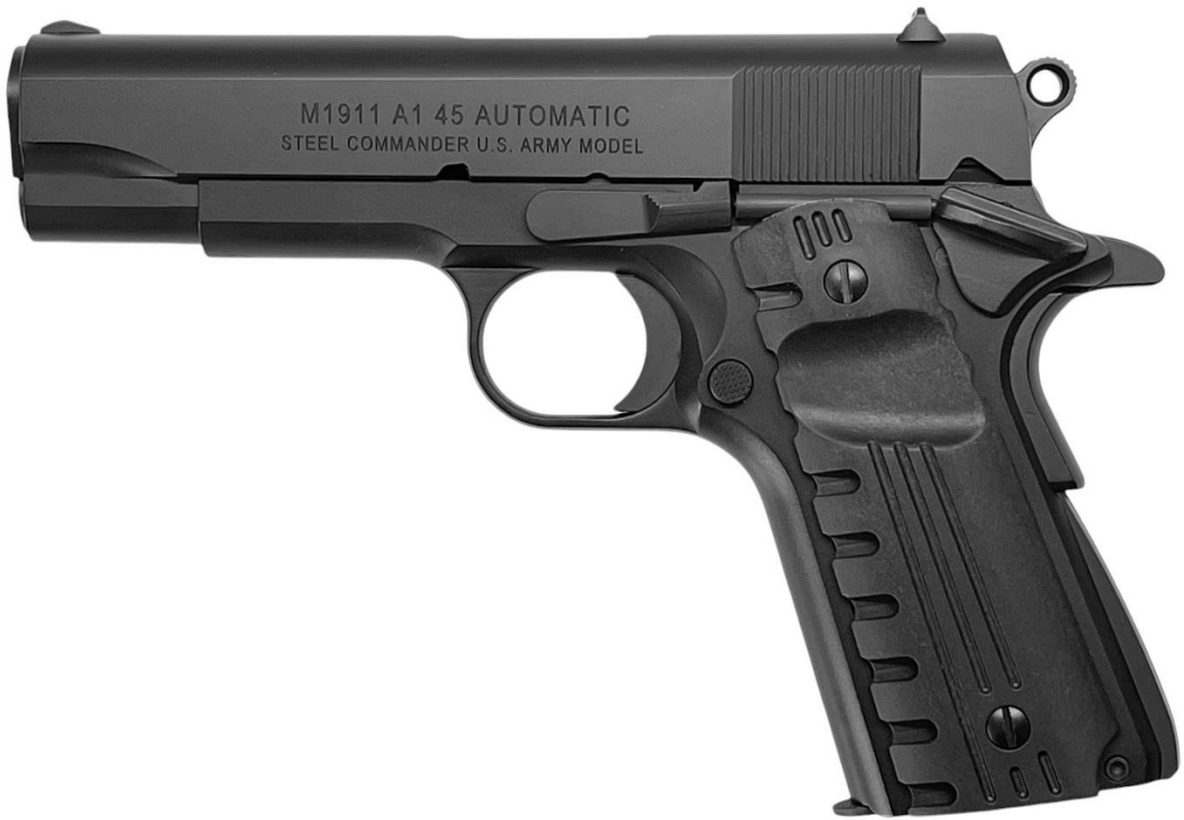
1911 High Grade Tactical Grips (Aluminum CNC made)